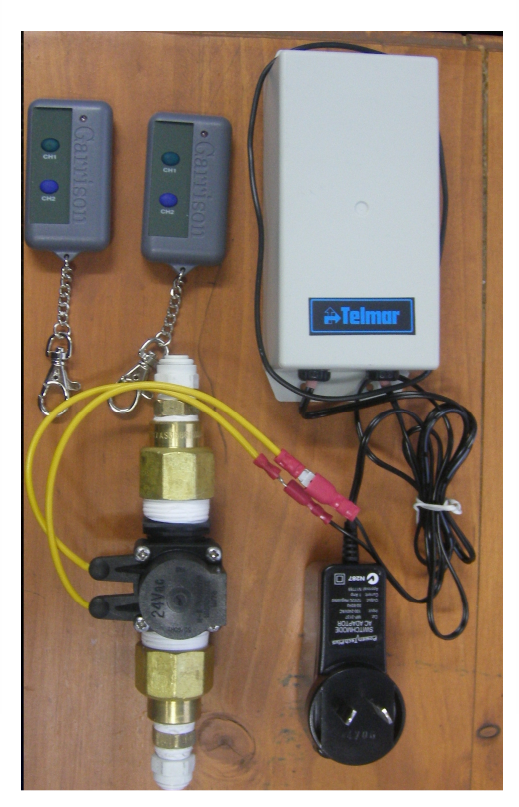
Illustration of Kit